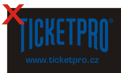
Logo on a dark background