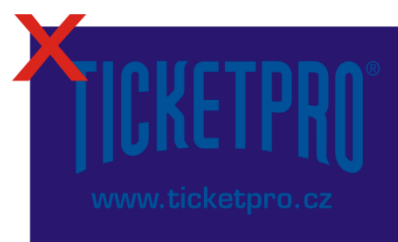
Logo on a dark background