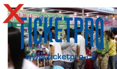
Logo on a busy background